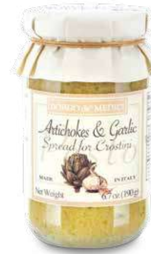
ARTICHOKES & GARLIC Spread ~ FC022007 ~ 6.7 oz (190g)