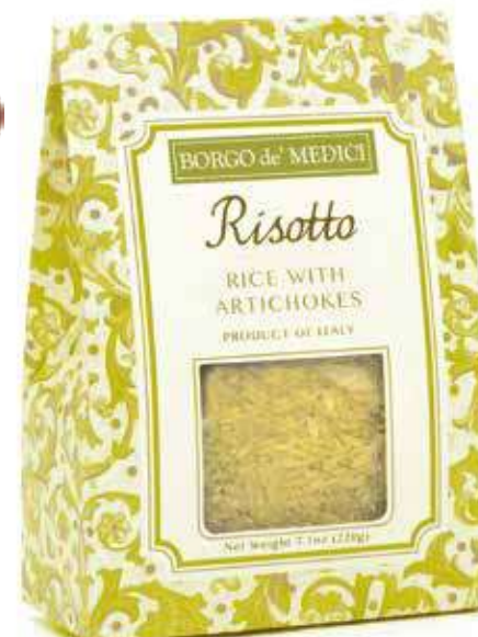
ARTICHOKE RISOTTO ~ A033046 ~ 7.7 oz (220g)