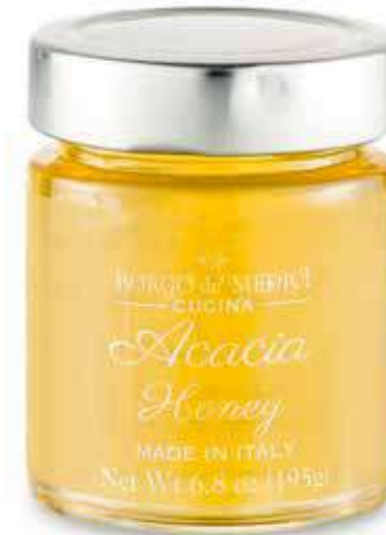
ACACIA HONEY FROM TUSCANY ~ AS01672 ~ 6.8 oz (195g)

Our pure honey is produced by artisanal beekeepers spread throughout Tuscany's most untouched countryside before being processed by us. The honey comes primarily from the area's mountains and hillsides, but a portion comes from the coastal and beach regions as well. All of our honey is characterized by a naturalness that can only come from untouched land and the floral and fruit-bearing plants so plentiful in our region.