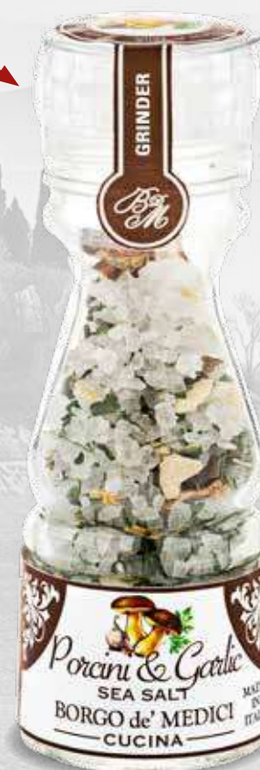
PORCINI & GARLIC SEA SALT with mini grinder ~ AS01656 ~ 2.82 oz (80g)

Porcini mushrooms bits with garlic and parsley to finish risotto and meat dishes.