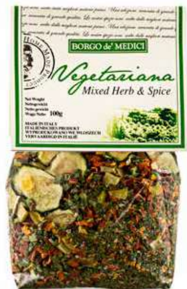
VEGETARIANA MIXED SPICES ~ A0301659 ~ 3.52 oz (100g)