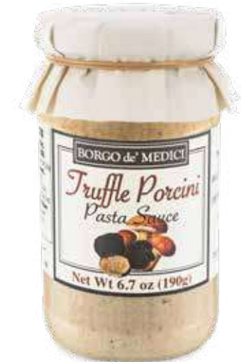
TRUFFLE PORCINI CREAM Pasta Sauce ~ AS01648 ~ 6.7 oz (190g)