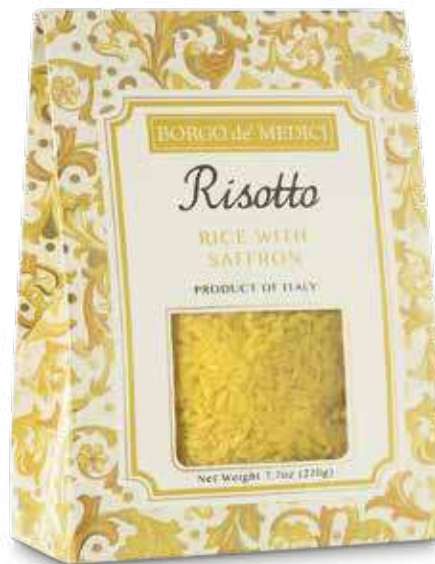
SAFFRON RISOTTO ~ A033033 ~ 7.7 oz (220g)