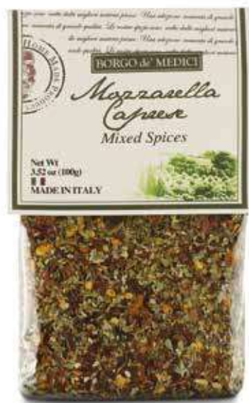
MOZZARELLA CAPRESE MIXED SPICES ~ A030104ED ~ 3.52 oz (100g)