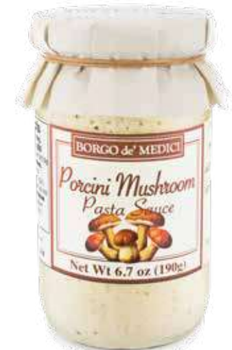
PORCINI MUSHROOM Pasta Sauce ~ AS01647 ~ 6.7 oz (190g)