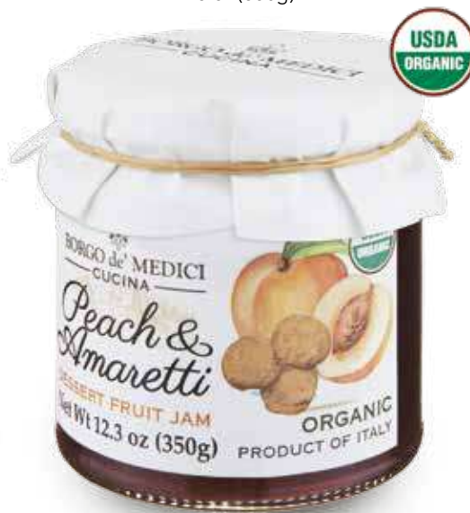
ORGANIC PEACH & AMARETTI DESSERT JAM ~ A091104B ~ 12.3 oz (350g)