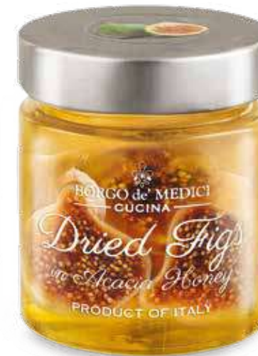
DRIED FIGS IN ACACIA HONEY ~ A093018 ~ 6.8 oz (195g)

Made with Pure Honey harvested in Tuscany