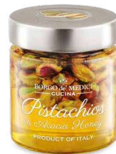
PISTACHIOS IN ACACIA HONEY ~ A093015 ~ 6.8 oz (195g)