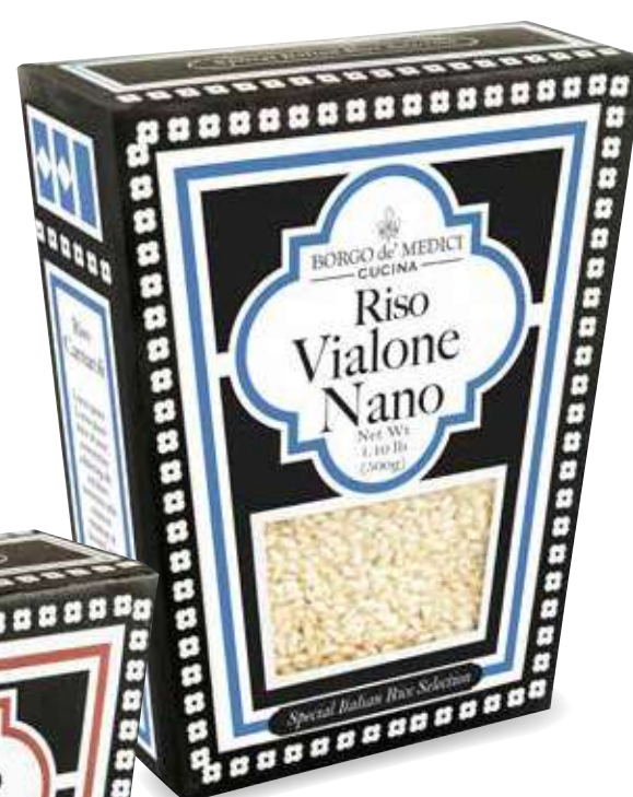
VIALONE NANO RICE ~ AS01681 ~ 1.10 lb (500g)

Vialone nano has a shorter grain, a good absorption when cooked, and is another rice with low stickiness or starch. This is preferred in the north-east Italy (Veneto) for traditional recipes that require a looser risotto with a firm grain.