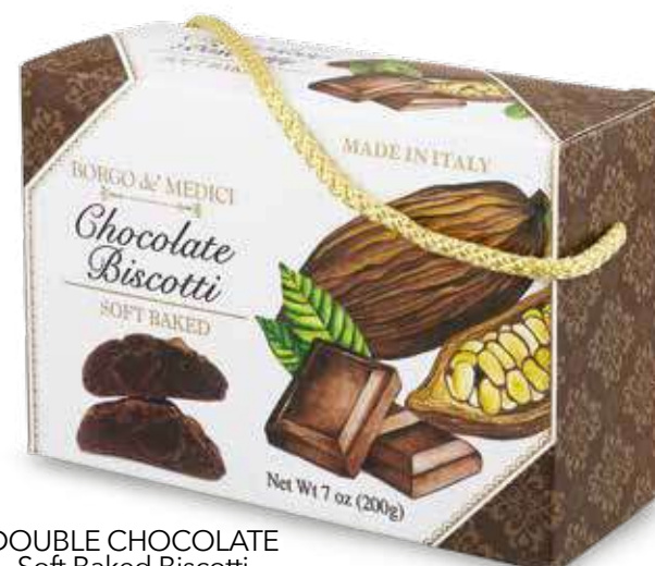
DOUBLE CHOCOLATE Soft Baked Biscotti ~ A050313 ~ 7 oz (200g)