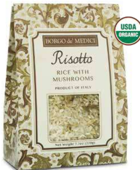
ORGANIC MUSHROOM RISOTTO ~ A033036B ~ 7.7 oz (220g)