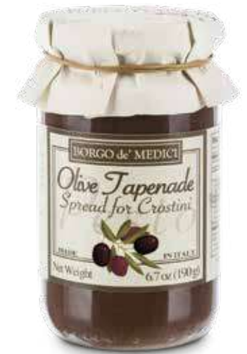
BLACK OLIVE TAPENADE ~ FC022008 ~ 6.7 oz (190g)