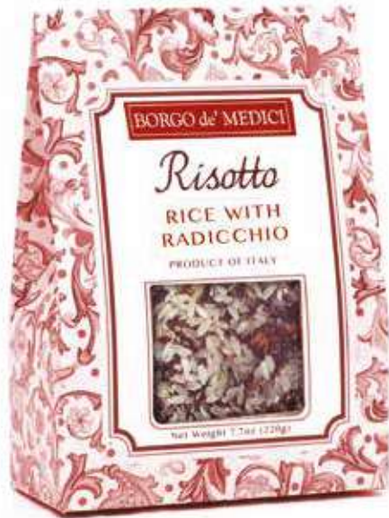
RADICCHIO RISOTTO ~ A033047 ~ 7.7 oz (220g)

Each package contains all ingredients to prepare three portion of risotto.