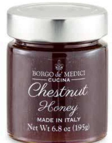
CHESTNUT HONEY FROM TUSCANY ~ AS01674 ~ 6.8 oz (195g)