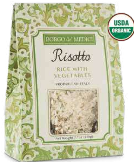
ORGANIC VEGETABLE RISOTTO ~ A033032B ~ 7.7 oz (220g)