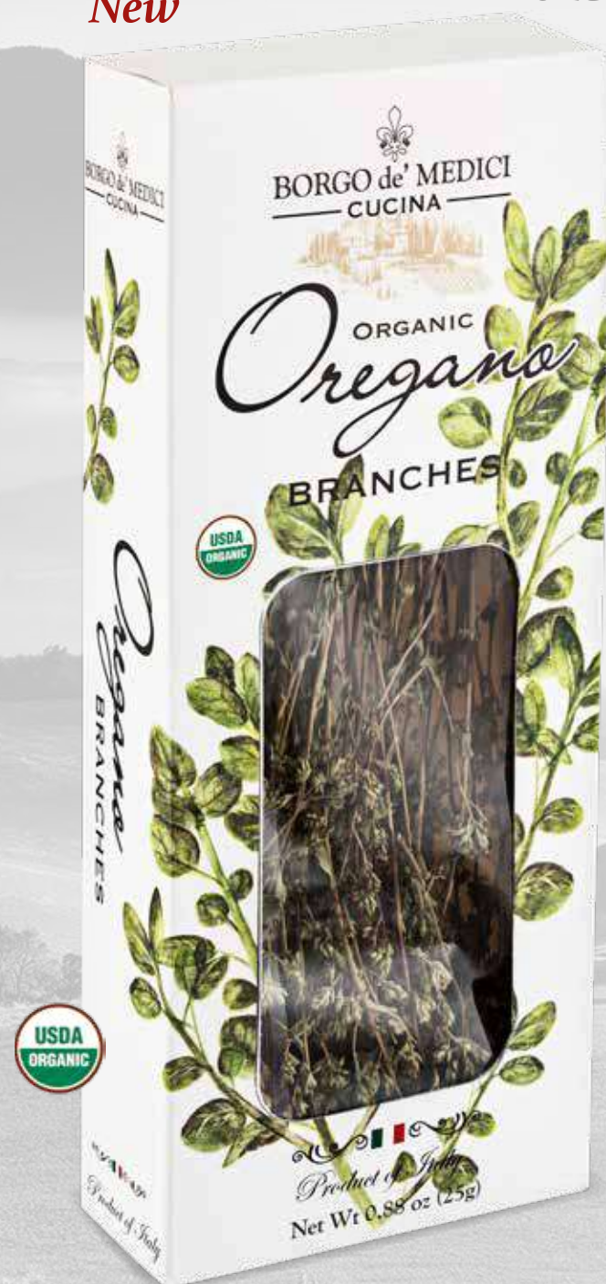
ORGANIC OREGANO Branches ~ AS01683 ~ 0.88 oz (25 g)