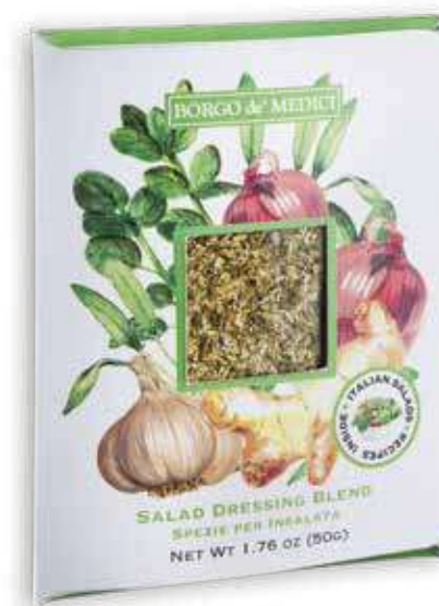
SPEZIE PER INSALATA Salad Dressing Blend ~ A030081 ~ 1.76 oz (50g)