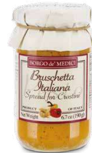
BRUSCHETTA ITALIANA Ricotta Cheese & Bell Peppers ~ A023018 ~ 6.7 oz (190g)