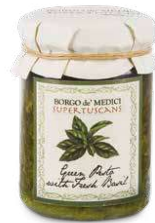
GOURMET PESTO ~ A017013 ~ 4.6 oz (130g)

Our Gourmet Basil Pesto has taken Pesto to a whole new level, with premium ingredients including the finest “DOP” basil and top quality olive oil.