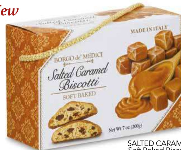
SALTED CARAMEL Soft Baked Biscotti ~ A050327 ~ 7 oz (200g)