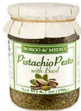
PISTACHIO PESTO with Basil ~ AS01645 ~ 6.7 oz (190g)

Our Gourmet Basil Pesto has taken Pesto to a whole new level, with premium ingredients including the finest “DOP” basil and top quality olive oil.