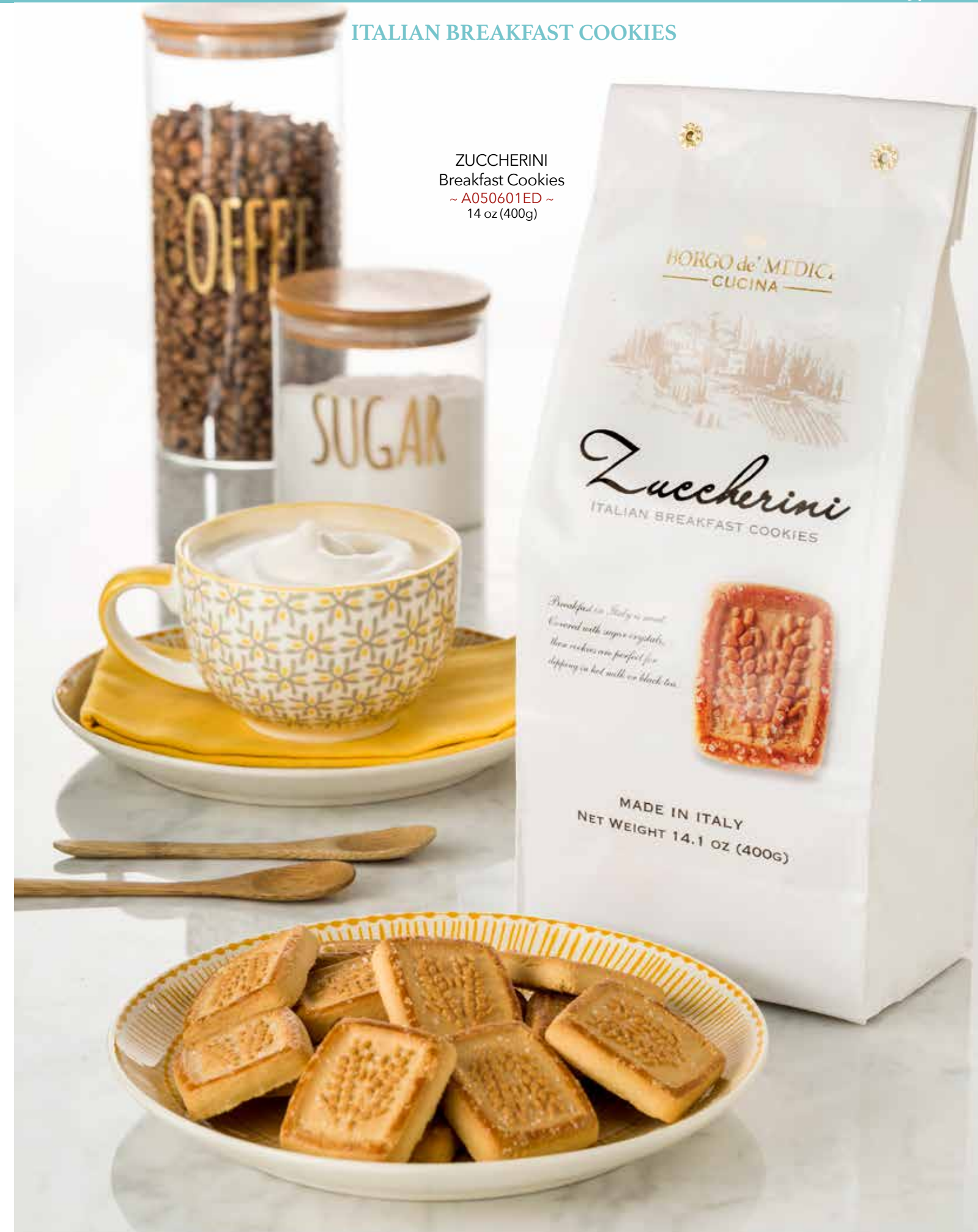
ZUCCHERINI Breakfast Cookies ~ A050601ED ~ 14 oz (400g)