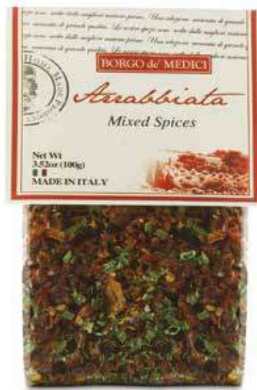
ARRABBIATA MIXED SPICES ~ A030102ED ~ 3.52 oz (100g)