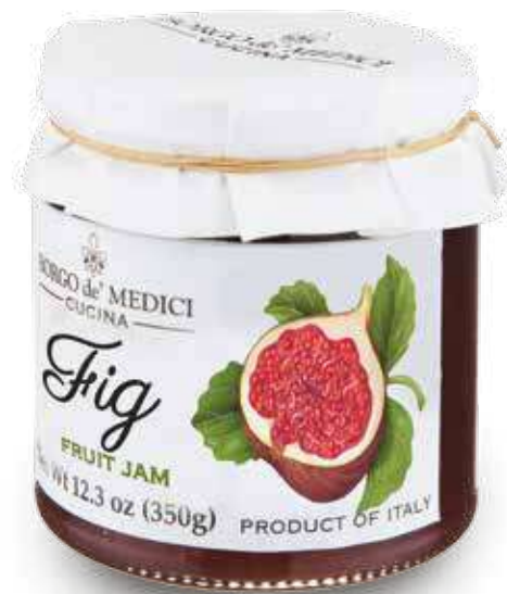
FIG JAM ~ FC001014ED ~ 12.3 oz (350g)