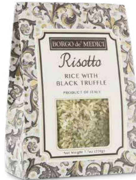
TRUFFLE RISOTTO ~ A033037 ~ 7.7 oz (220g)