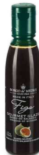
FIG BALSAMIC GLAZE ~ A029030 ~ 5.1 fl oz (150 ml)

TRUFFLE BALSAMIC GLAZE ~ A029031 ~ 5.1 fl oz (150 ml)