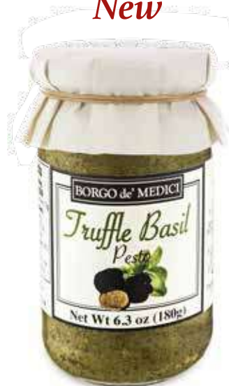
TRUFFLE BASIL PESTO ~ AS01646 ~ 6.35 oz (180g)

“with 15% Pistachio, basil and Parmigiano Reggiano PDO cheese”