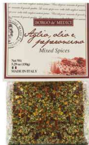
AGLIO, OLIO & PEPERONCINO MIXED SPICES ~ A030101ED ~ 5.29 oz (150g)