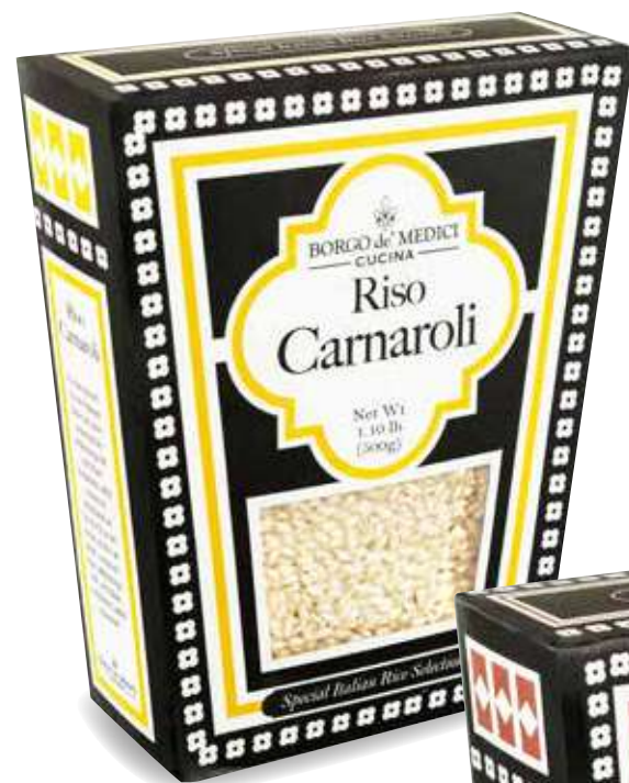
CARNAROLI RICE ~ AS01680 ~ 1.10 lb (500g)

Carnaroli is the rice preferred by most Italian cooks, has a wonderful absorption, releases enough starch to make the risotto creamy and not sticky, while the grains still remain firm - "al dente".