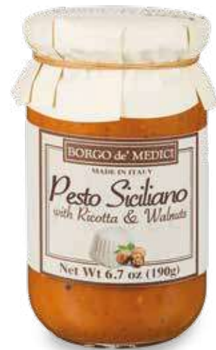
PESTO SICILIANO with Walnuts & Ricotta Cheese ~ A023019 ~ 6.7 oz (190g)

New Flavor - Creamy Texture - With only Italian basil