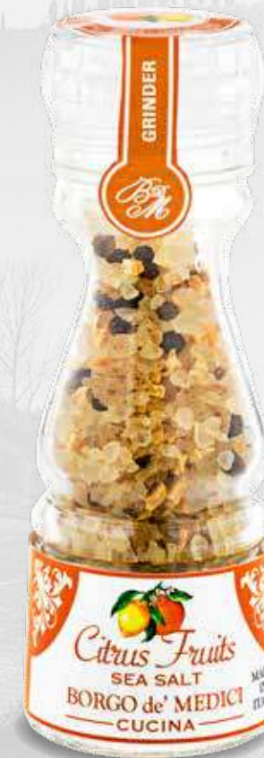
CITRUS FRUITS SEA SALT with mini grinder ~ AS01658 ~ 3.32 oz (94g)

Lemon Essential oil flavored Salt with citrus peels and Sichuan pepper.