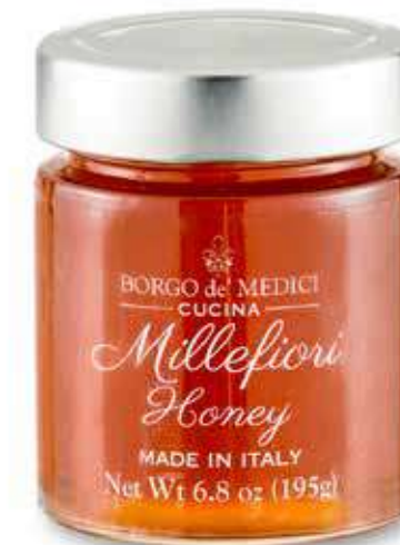
MILLEFIORI HONEY FROM TUSCANY ~ AS01673 ~ 6.8 oz (195g)