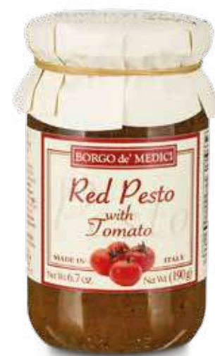
RED PESTO ~ A017019 ~ 6.7 oz (190g)