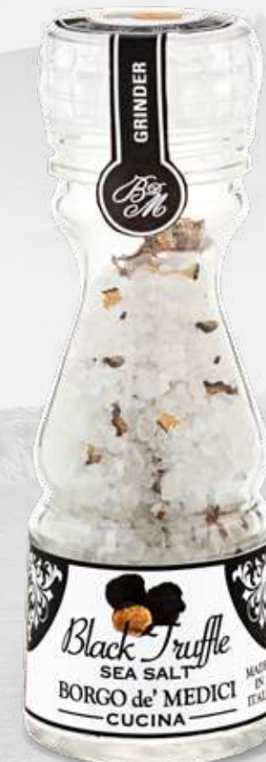
BLACK TRUFFLE SEA SALT with mini grinder ~ AS01657 ~ 3.39 oz (96g)

Black Truffle freeze dried slices with sicilian salt in rocks perfect to finish egg and vegetable dishes.