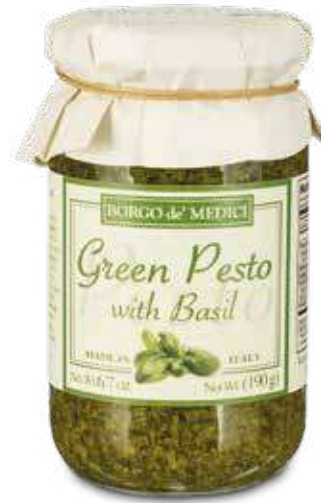
GREEN PESTO ~ A017005 ~ 6.7 oz (190g)