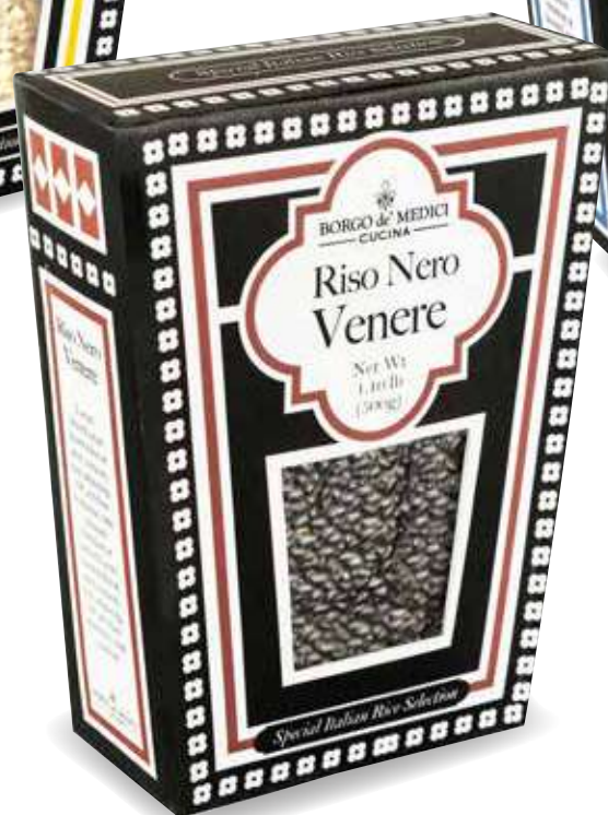
VENERE BLACK RICE ~ AS01682 ~ 1.10 lb (500g)

Venere black rice is very rich in minerals and vitamins, is suitable for seafood risotto or summer preparations.