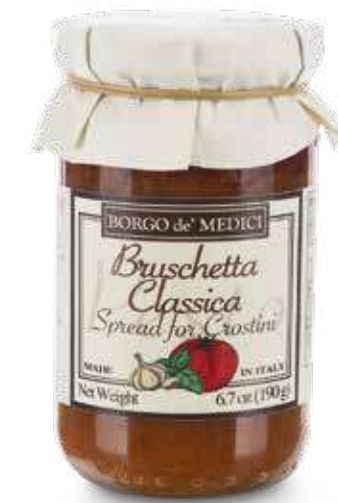
BRUSCHETTA CLASSICA Sundried Tomato Garlic & Basil ~ A023012 ~ 6.7 oz (190g)