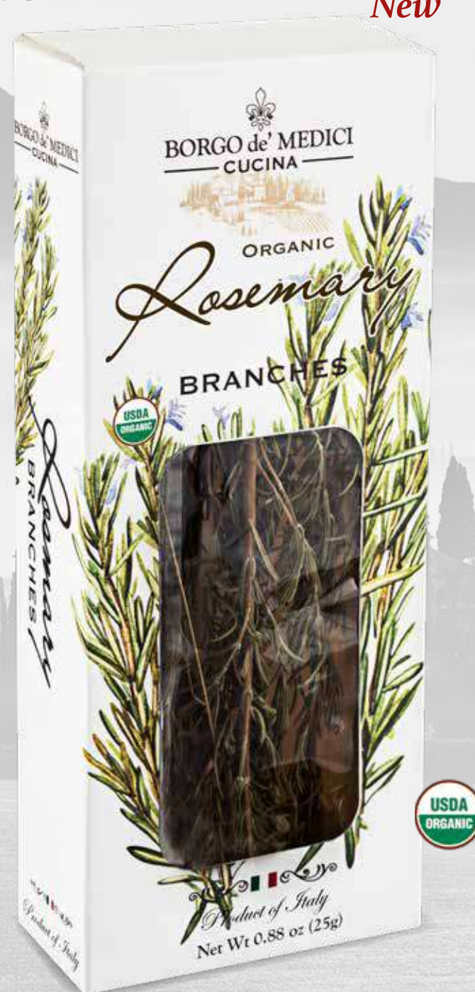
ORGANIC ROSEMARY Branches ~ AS01684 ~ 0.88 oz (25 g)

The cultivation is carried out rigorously with biological methods, all stages of processing are carried out by hand without resorting to irrigations, pesticides and fertilizers but only to sun, high mountain air and an uncontaminated soil.