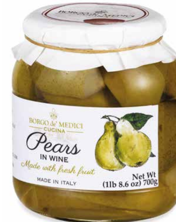
Pears in Sweet Wine ~ A108002ED ~ 1lb 9.4 oz (720g) 4.3"x3.3"x5.3" 6 units/case

Fresh fruit hand picked and cut, preserved in sweet wine