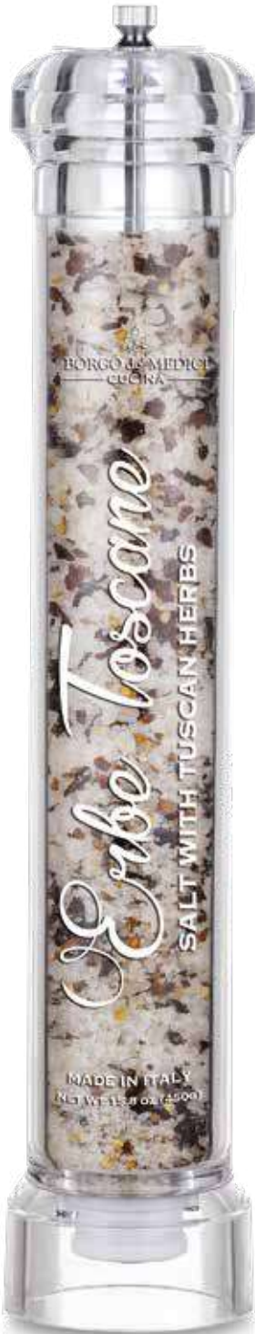
Salt with Tuscan Herbs ~ A059104ED ~ 15.8 oz (450g) 2.9"x2.9"x15.7" 6 units/case