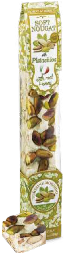
Torrone Soft Nougat with Pistachios ~ A053010 ~ 3.5 oz (100g) 1.3"x1"x8.8" 10 units/case