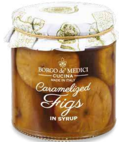
Caramelized Figs in Syrup ~ A108011ED ~ 11.3 oz (320g) 2.9"x2.9"x3.5" 6 units/case

Caramelized fig it's pretty much identical to our fig jam recipe (only with slightly less sugar), here they are barely touched, so that they do not break but remain perfectly whole. It's delicious with soft cheeses, which is how it's traditionally eaten, as part of a cheese platter.