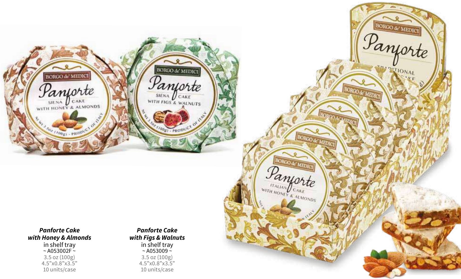
Panforte Cake with Honey & Almonds in shelf tray ~ A053002F ~ 3.5 oz (100g) 4.5"x0.8"x3.5" 10 units/case

Taste as it is or paired to cheese, this is a wonderful Tuscan sweetness