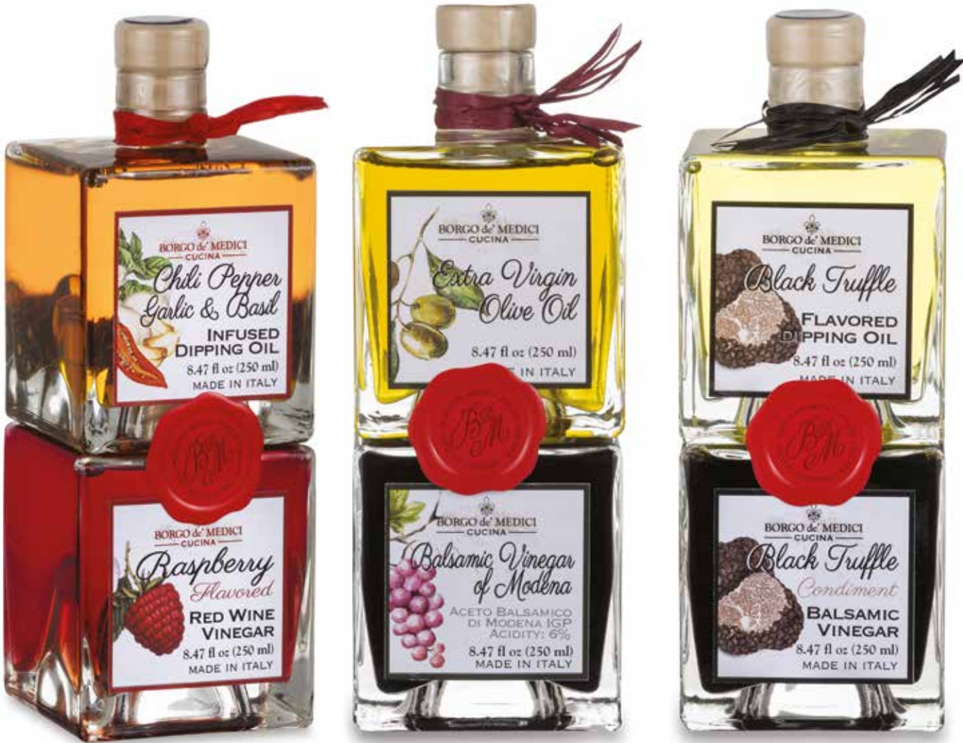
Flavored Condiments Stackable Bottle ~ A112010ED~ 16.9 fl oz (500ml) 3"x3"x8.3" - 6 units/case Contains: Infused Garlic, Chili pepper, Basil Condiment 8.47 fl oz Raspberry Vinegar 8.47 fl oz