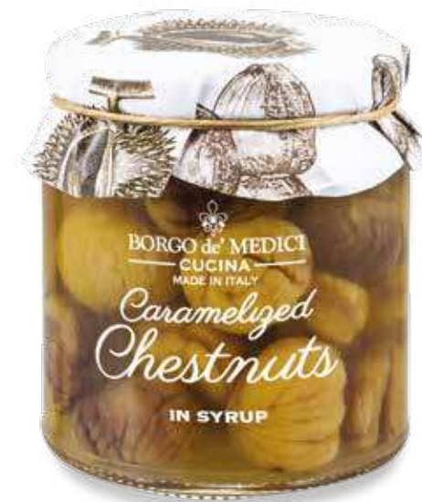
Caramelized Chestnut in Syrup ~ A108012ED ~ 12.35 oz (350g) 2.9"x2.9"x3.5" 6 units/case

Caramelized Chestnuts is a typical product in Tuscany. The chestnuts are roasted while they are still fresh and then placed in the syrup made with sugar cane. Try the roasted chestnuts on their own, on gelato or to prepare your favourite desserts.