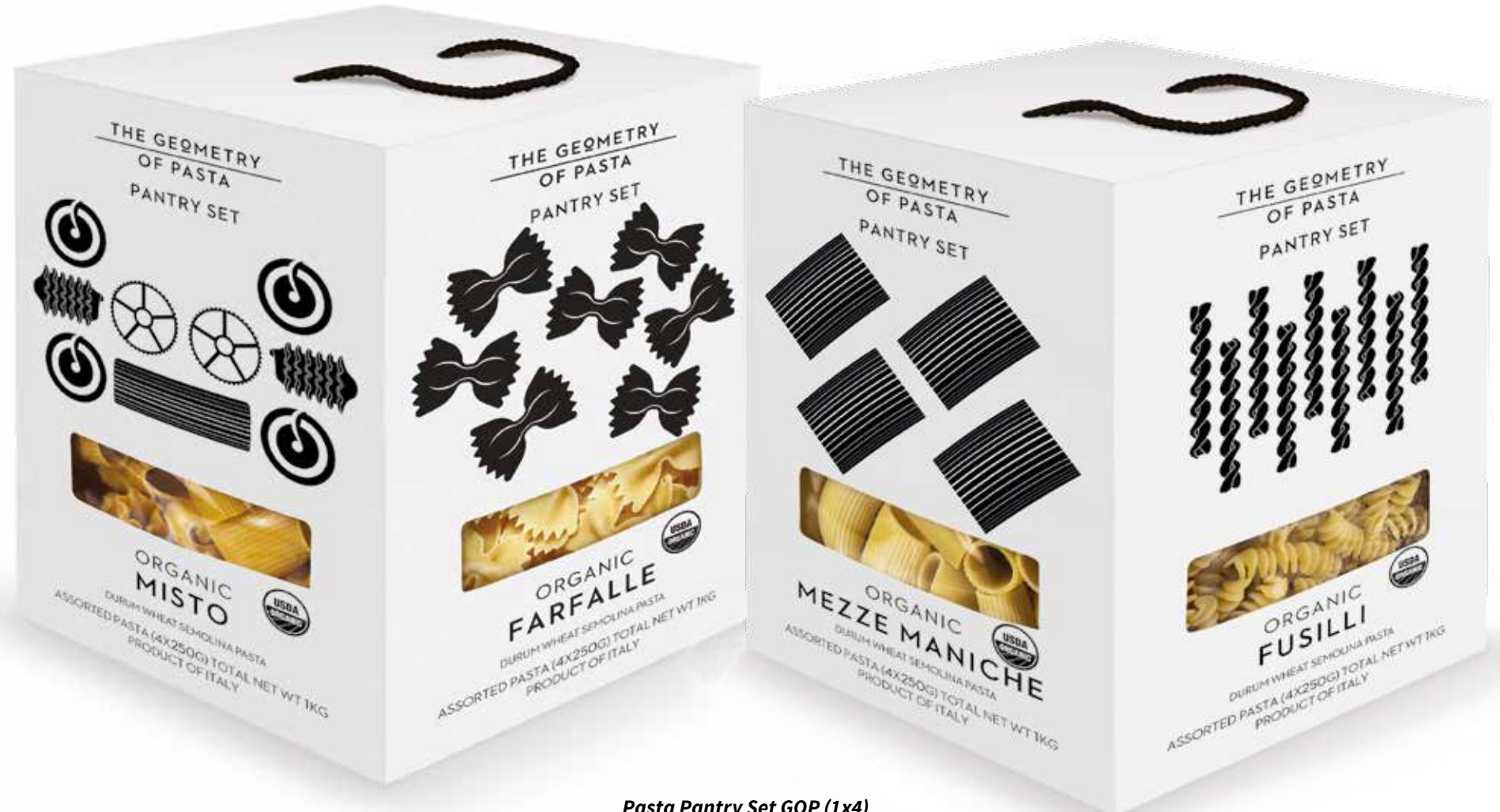
Pasta Pantry Set GOP (1x4) Contains: 4 shapes of pasta (4x8.8oz) ~ AG01862 ~ 35.27 oz (1000g) 7"x 7"x 8" - 4 units/case