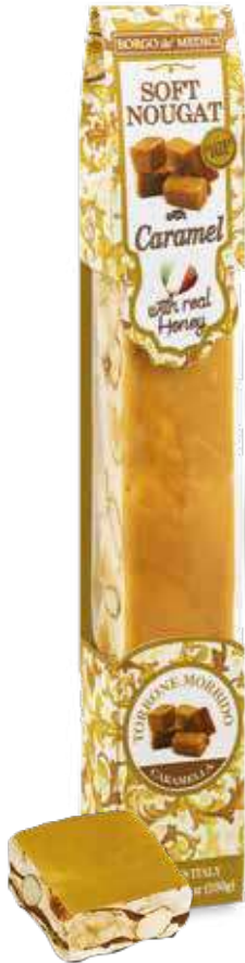
Torrone Soft Nougat with Caramel ~ A053024 ~ 3.5 oz (100g) 1.3"x1"x8.8" 10 units/case