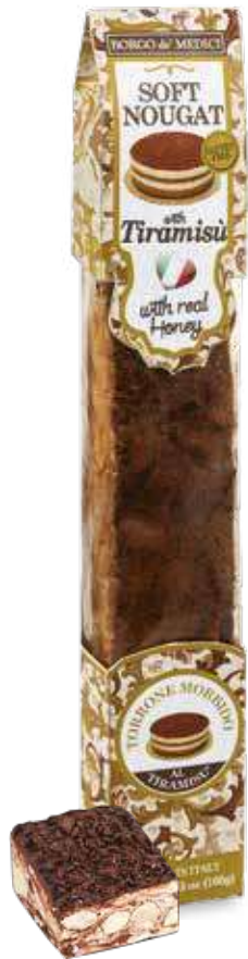
Torrone Soft Nougat with Tiramisù ~ A053012 ~ 3.5 oz (100g) 1.3"x1"x8.8" 10 units/case