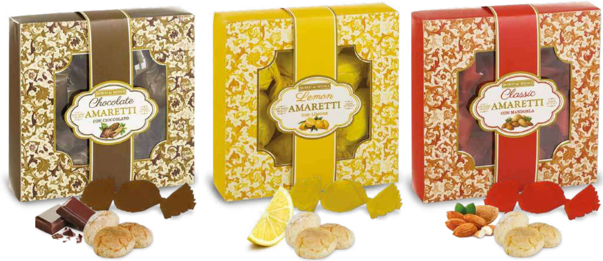
Chocolate Soft Amaretti ~ A050236 ~ 4.05 oz (115g) 6.8"x6.8"x1.5" 6 units/case