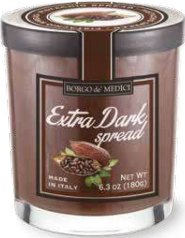
Extra Dark Cocoa & Hazelnut Spread ~ AS01555 ~ 6.3 oz (180g) 2.8"x2.8"x3.3" 6 units/case

Nut spreads with cocoa for your sweet moments. Simply paired to bread, cookies or used as a key ingredient for your cakes, they will enrich your desserts