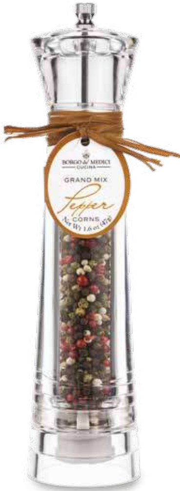
Mixed Peppercorns ~ A059111ED ~ 1.6 oz (45g) 2.5"x2.5"x11" 6 units/case