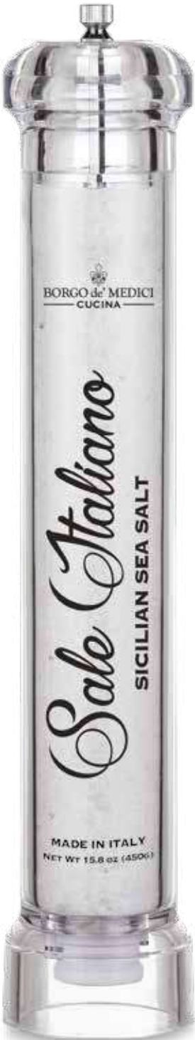
Italian Sea Salt ~ A059105ED ~ 15.8 oz (450g) 2.9"x2.9"x15.7" 6 units/case