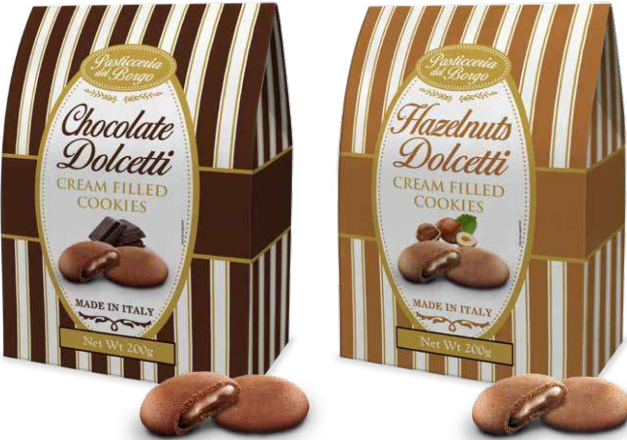
Chocolate Dolcetti ~ AS02249 ~ 7.0 oz (200g) 12.9"x 3.5"x 10.5" 6 units/case Hazelnuts Dolcetti ~ AS02250 ~ 7.0 oz (200g) 12.9"x 3.5"x 10.5" 6 units/case