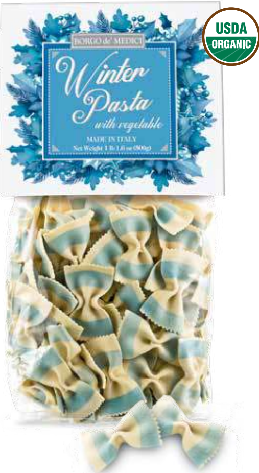
Organic Chistmas Winter bow ties pasta ~ AS02253 ~ 8.8 oz (250g) 5"x 1.6"x 9.4" 12 units/case