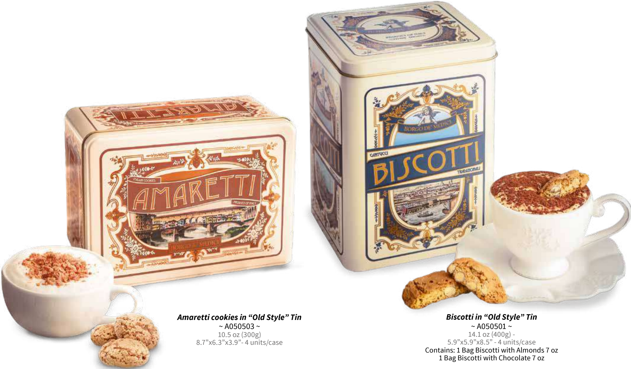
Amaretti cookies in “Old Style” Tin ~ A050503 ~ 10.5 oz (300g) 8.7"x6.3"x3.9" - 4 units/case