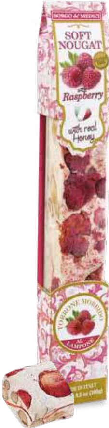
Torrone Soft Nougat with Raspberry ~ A053022 ~ 3.5 oz (100g) 1.3"x1"x8.8" 10 units/case