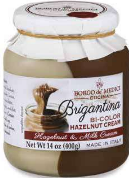
Bi-Color Brigantina Hazelnut & Milk Spread ~ A103007ED ~ 14 oz (400g) 3.3"x2.8"x4.3" 6 units/case