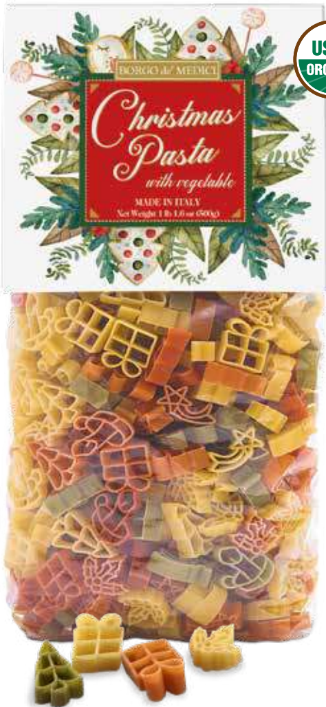
Organic Christmas Shapes 5 Colors Pasta ~ A042051 ~ 1lb 1.6 oz (500g) 5.1"x2.8"x9.1" 12 units/case