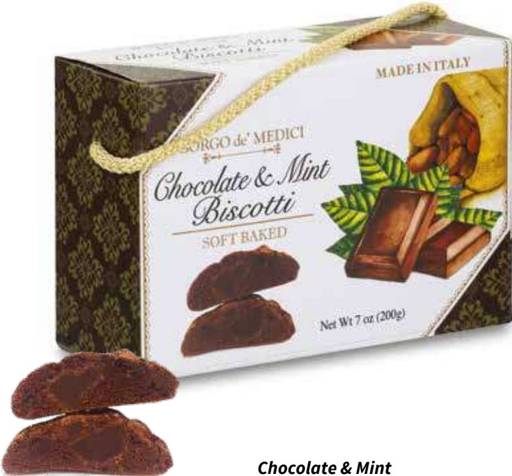
Chocolate & Mint Soft Baked Biscotti in Box ~ A050328 ~ 7.oz (200g) 6.8"x2.5"x4.7" - 6 units/case

The result sees the trademark crispness of Cantucci give way to a delicate softness that perfectly wraps itself around a sweet filling. To date, nobody has been able to recreate the mixture that makes these biscotti unique. These are the perfect gift for those looking for something unique and made with only the highest quality ingredients, or as the final course in any Holiday meal.