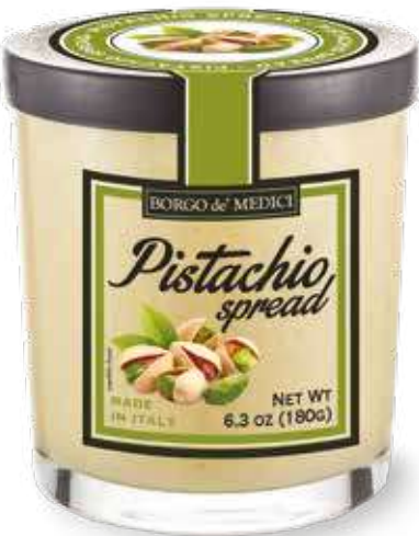
Pistachio Spread ~ AS01554 ~ 6.3 oz (180g) 2.8"x2.8"x3.3" 6 units/case