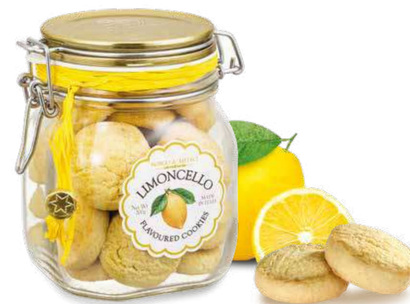
Limoncello Flavored Frollini Tea Cookies in jar (individually wrapped inside) ~ A050072 ~ 7 oz (200g) 4.3"x4.3"x5.3" 6 units/case