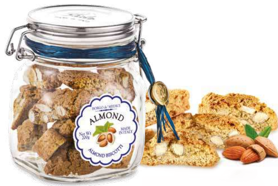
Almond Biscotti in jar (individually wrapped inside) ~ AS01550 ~ 7 oz (200g) 4.3"x4.3"x5.3" 6 units/case

Fine Tuscan pastry individually wrapped contained in an elegant Bormioli Fido Glass Jar made in Italy