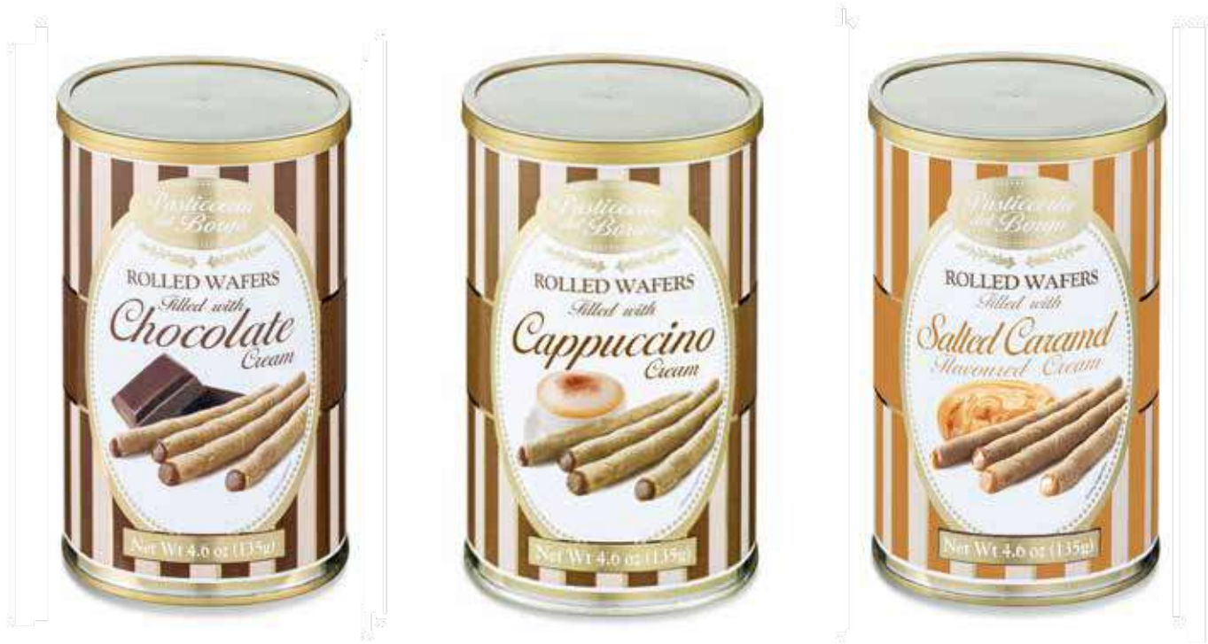
Chocolate Rolled Wafer ~ AS02246 ~ 4.7 oz (135g) 2.73"x 2.73"x 5.5" 6 units/case Cappuccino Rolled Wafer ~ AS02247 ~ 4.7 oz (135g) 2.73"x 2.73"x 5.5" 6 units/case Salted Caramel Rolled Wafer ~ AS02248 ~ 4.7 oz (135g) 2.73"x 2.73"x 5.5" 6 units/case