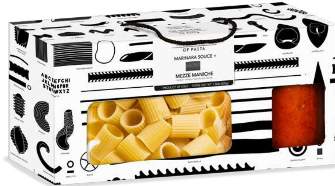
Marinara Sauce and Organic Pasta GOP (1+1) Contains: Marinara sauce 8.8 oz, Mezze maniche organic pasta 17.6 oz ~ AG01871 ~ 1.6 lb (780g) 12.5"x 3.1"x 9.5" - 4 units/case