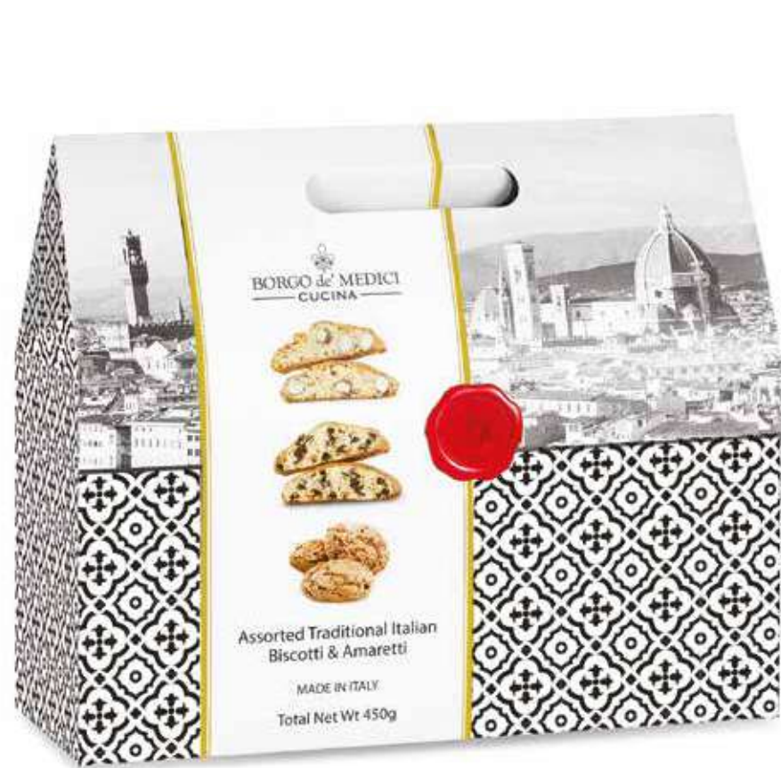
Classic Florentine Cookies Collection

Contains: Almond Biscotti Chocolate Biscotti Crisp Amaretti ~ A050111LF ~ 15.9 oz (450g) 13.4"x3.5"x10.6" 4 units/case