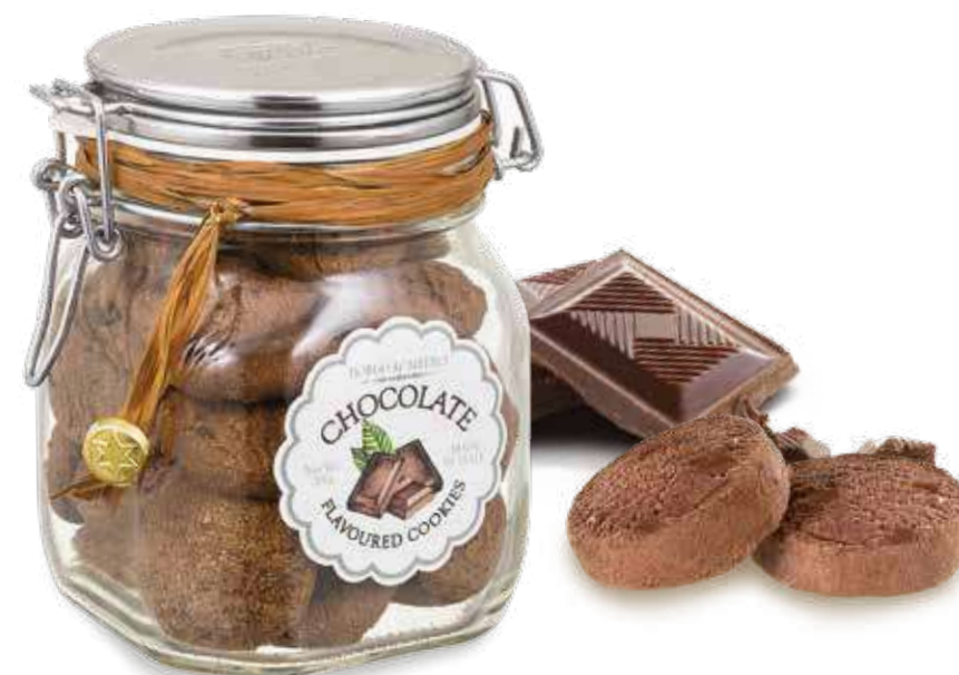
Chocolate Flavored Frollini Tea Cookies in jar (individually wrapped inside) ~ A050073 ~ 7 oz (200g) 4.3"x4.3"x5.3" 6 units/case