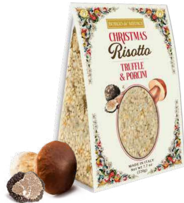
Christmas risotto with truffle e mushromms ~ AS02252 ~ 7.7 oz (220g) 3.9"x 1.6"x 5.9" 8 units/case

Black Truffle risotto with Porcini Mushrooms is the perfect addition to your holiday feasts, whatever u are looking for a special Christmas dinner idea or that perfect Thanksgiving side. The recipe is easy to follow and the dish is very creamy and decadent. Your guests will be impressed immensely by the beautiful presentation and high quality ingredients. Truffle & Porcini Risotto can be your holiday first course, main course, or side dish.