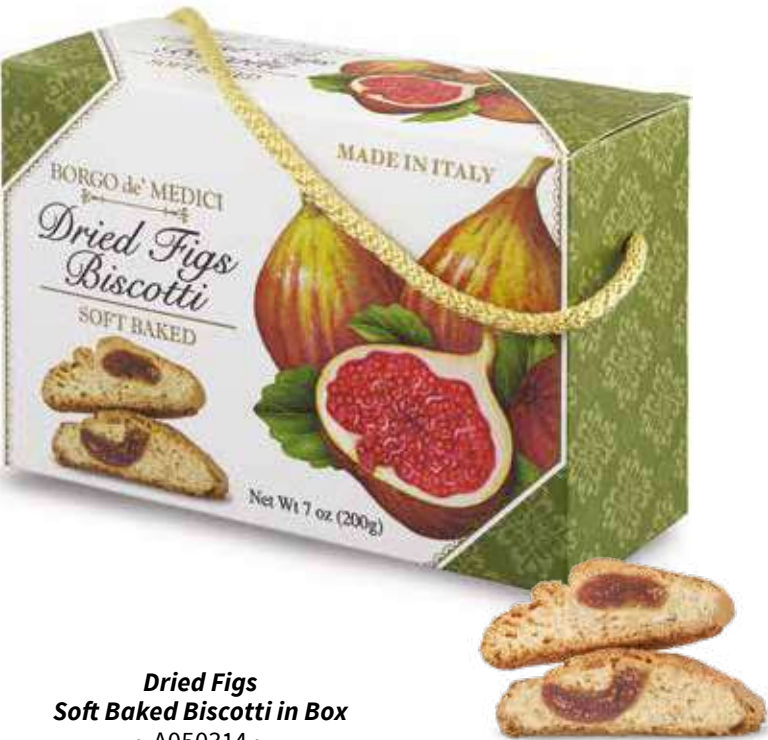
Dried Figs Soft Baked Biscotti in Box ~ A050314 ~ 7oz (200g) 6.8"x2.5"x4.7" - 6 units/case