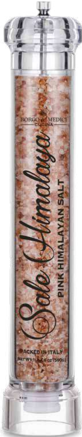
Himalayan Salt ~ A059107ED ~ 1lb 4.7 oz (590g) 2.9"x2.9"x15.7" 6 units/case