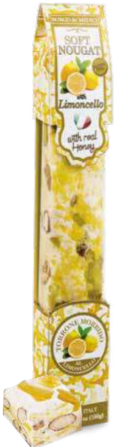
Torrone Soft Nougat with Limoncello ~ A053033 ~ 3.5 oz (100g) 1.3"x1"x8.8" 10 units/case