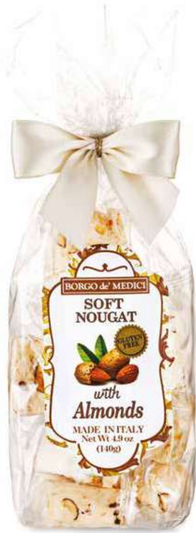
Torrone Soft Nougat with Almonds Bite Size ~ AS01552 ~ 4.9 oz (140g) 3"x2.2"x9.1" 8 units/case