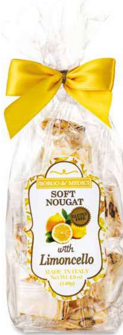
Torrone Soft Nougat with Limoncello Bite Size ~ AS01553 ~ 4.9 oz (140g) 3"x2.2"x9.1" 8 units/case