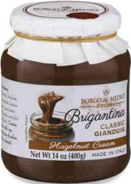
Classic Brigantina Hazelnut Spread ~ A103005ED ~ 14 oz (400g) 3.3"x2.8"x4.3" 6 units/case