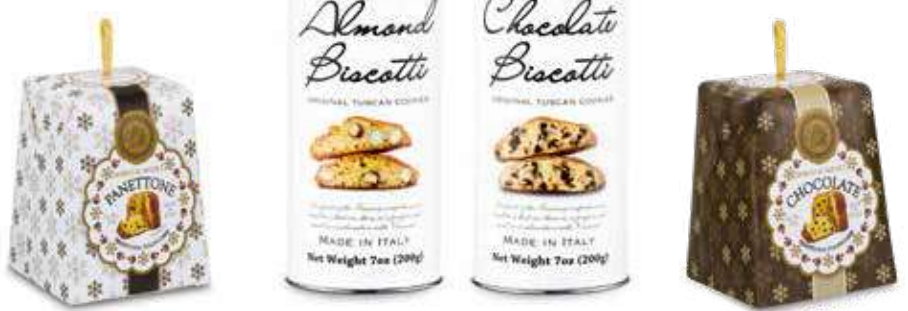
Products contained in the lower layer

2 Layers Luxury Hamper Contains: Truffle risotto 7.7 oz Black truffle sauce 6.3 oz Truffle linguine pasta in box 8.8 oz Limoncello cookies 6.3 oz Chocolate biscotti 6.3 oz Mini panettone 3.5 oz Mini panettone chocolate 3.5 oz Extra virgin olive oil 8.8 Fl oz decorated ceramic oil bottle ~ AG01868 ~ 2.6 lb (1220g) + 8.8 fl oz (250ml) 11.4"x 15.4"x7.5" - 1 units/case