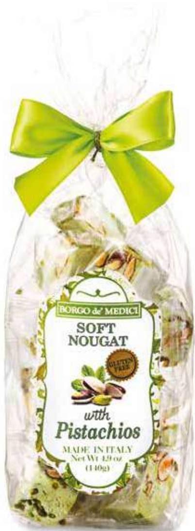
Torrone Soft Nougat with Pistachios Bite Size ~ AS01551 ~ 4.9 oz (140g) 3"x2.2"x9.1" 8 units/case