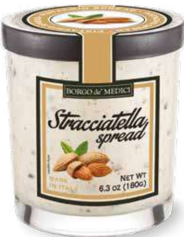
Stracciatella Almond Spread with Crushed Roasted Cocoa Beans ~ AS01556 ~ 6.3 oz (180g) 2.8"x2.8"x3.3" 6 units/case