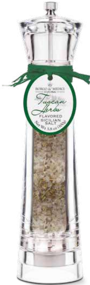
Tuscan Herbs Salts ~ A059114ED ~ 4.2 oz (120g) 2.5"x2.5"x11" 6 units/case